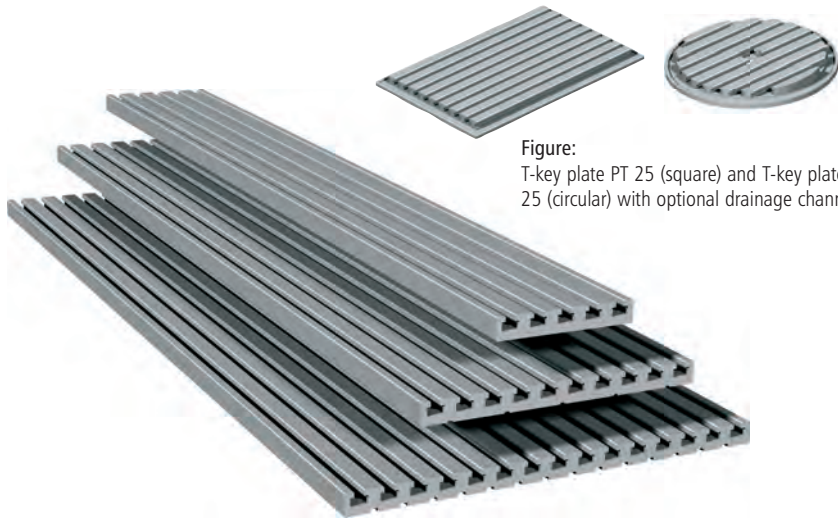
Figure: T-key plate PT 25 (square) and T-key plate PT 25 (circular) with optional drainage channel